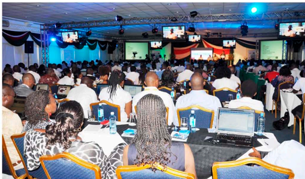
A workshop in session at the state-of-the-art Kileleni Conference Centre.