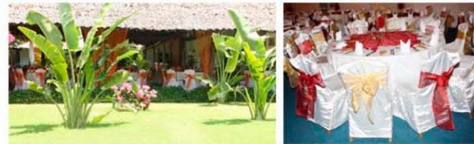
A section of Kileleni Conference Centre. Function setting

By 1980, tourism was booming. The hotel started to expand with the construction of 16 villas. But Dr. Meister's vision did not end here as he wanted to put up a golf course. So in 1991, famous golf player